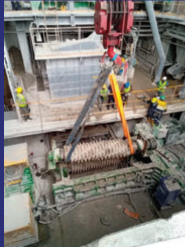
Mmd Crusher Rotors Exchange