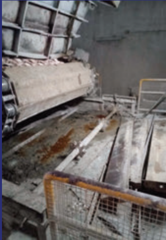
L/S Apron Feeder Overhaul