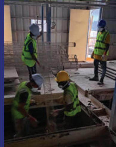
Main Baghouse Maintenance